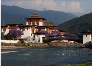
Thimphu 📍 🚗 77km - ⌚ 3h Punakha 📍