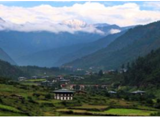
E-lukha 📍 7km - ⌚ 5h 30m Haa 📍