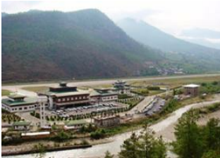
Paro Airport 📍