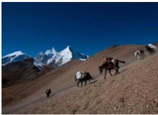
Thangthangkha 📍 19km - ⌚ 5h 20m Jangothang 📍