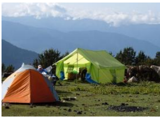
Soi Yaktsa 📍 11km - ⌚ 4h 30m Thombu Shong 📍