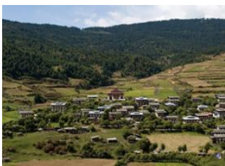
Thombu Shong 📍 13km - ⌚ 4h 30m Gunitsawa Village 📍