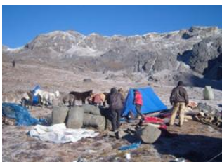
Jangothang 📍 16km - ⌚ 7h 30m Soi Yaktsa 📍