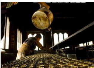
Trongsa 📍 68km - ⌚ 2h Bumthang 📍