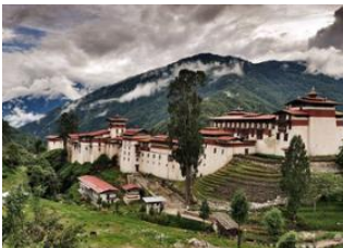
Punakha 📍 🚗 129km - ⌚ 5h Trongsa 📍