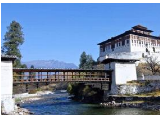
Phobjikha 📍 🚗 214km - ⌚ 7h Paro 📍