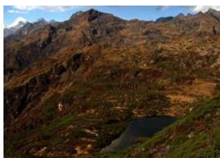
Gur 📍 12km - ⌚ 5h Labatama 📍