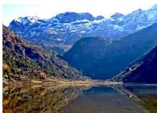
Gynekha 📍 7km - ⌚ 5h Gur 📍