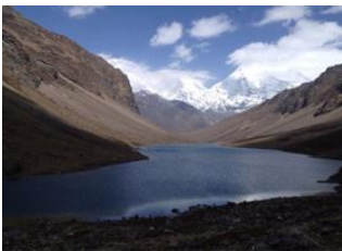
Labatama 📍 8km - ⌚ 6h 30m Panka 📍