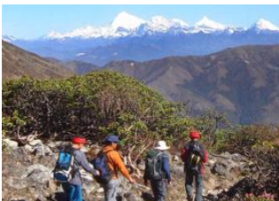
Panka 📍 8km - ⌚ 5h 20m Talakha 📍